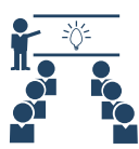
Best Practice of SDGs and CSR